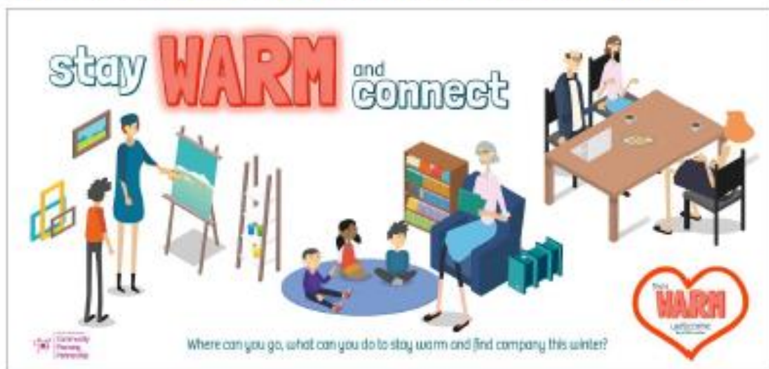
Figure 1: Campaign Graphic

Where can people go, and what can they do, to stay warm and find company this winter?