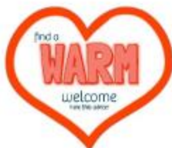
Figure 2: Warm Welcome Heart Graphic

A campaign graphic has been developed to encourage people to 'stay WARM and connect' and is supported by the question 'where can you go, what can you do to stay warm and find company this winter'. This is provided as a Jpeg that can be used on social media channels to promote the campaign to the public.